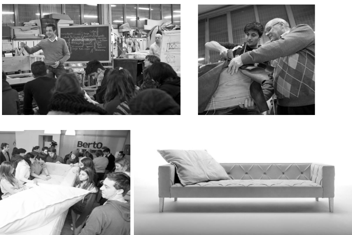
Fig. 1: The craftsman work behind the “#DivanoxManagua” project

The “#DivanoxManagua” project was born and developed between January and April 2013. The project consisted in the construction of a specimen of couch especially designed for the occasion. The participants in six open working sessions were as follows: master craftsmen of the company, an entire class of students in their third year of school for upholsterers Afol Meda, upholsterers of other companies, designers, entrepreneurs, journalists, customers, consultants and marketers mostly from the areas adjacent to sites where the sessions took place (Fig. 1). The age of participants in the project varied between 18 and 70 years old. They were primarily men (60%). The sixth session was held at FuoriSalone that is the set of events distributed in different areas of Milan (Italy) on days when the Salone Internazionale del Mobile is placed.