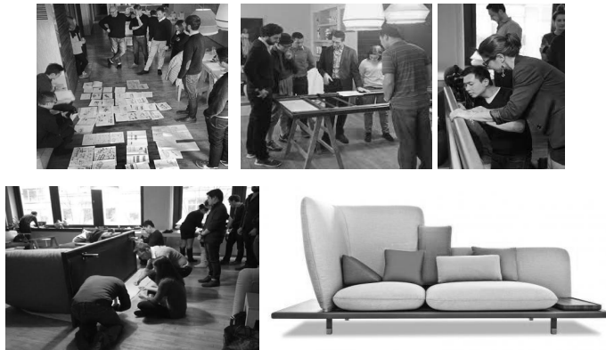
Fig. 2: The craftsman work behind the “Sofa4Manhattan” project